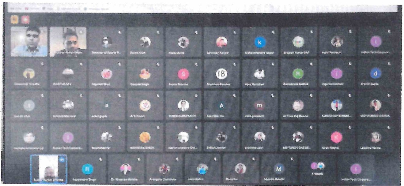
Session on Operation Management

Students got understanding of Operations Management, Objectives of Operations Management, Scope of Operations Management, Needs & Challenges of Operations Research to Decision Making, Operations Management and Decision Making, The Operations Management Strategy Development Process, Contribution of Operations Management to Business Policy Decisions, Designing of Goods and Services, Process Planning and Process Design, Process Analysis and Design, Process Management, Process Decisions etc.