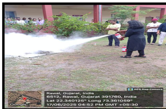
Fire Safety Training Activity