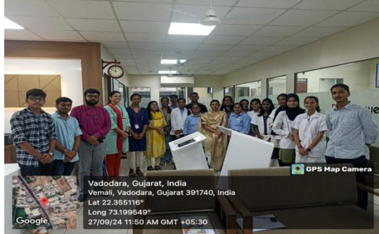
Industrial visit at Baroda Eye Institute, Sama- Savli Vadodara on 27 th Sept 2024

On 27th September 2024, 11 Optometry students, Four faculty members and one representative from the Training and Placement Office (TPO), ITMVU, visited Baroda Eye Institute, Sama-Savli, Vadodara. The program provided students with valuable exposure to clinical practices and hospital management, enhancing their understanding of patient care and professional responsibilities.