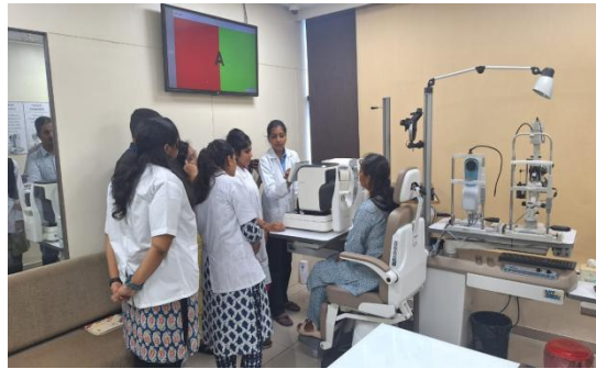
Senior Optometrist briefing Optometry student at Baroda Eye Institute, Sama- Savli Vadodara on 27 th Sept 2024