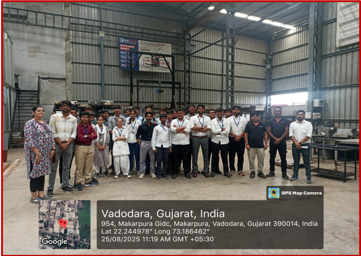
“Bridging education and industry – Proud moments from our student visit to Grey Matter Robotics Pvt. Ltd ”